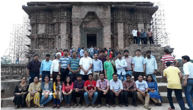
Local trip to Konarak with the ASA participants