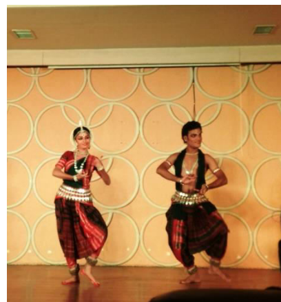
Cultural Night @ASA 2018