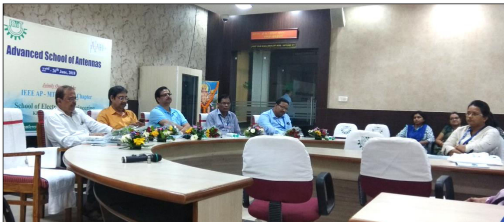
Dignitaries and expert panels at the ASA-2018